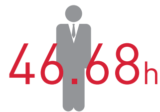
Average pro bono hours per attorney